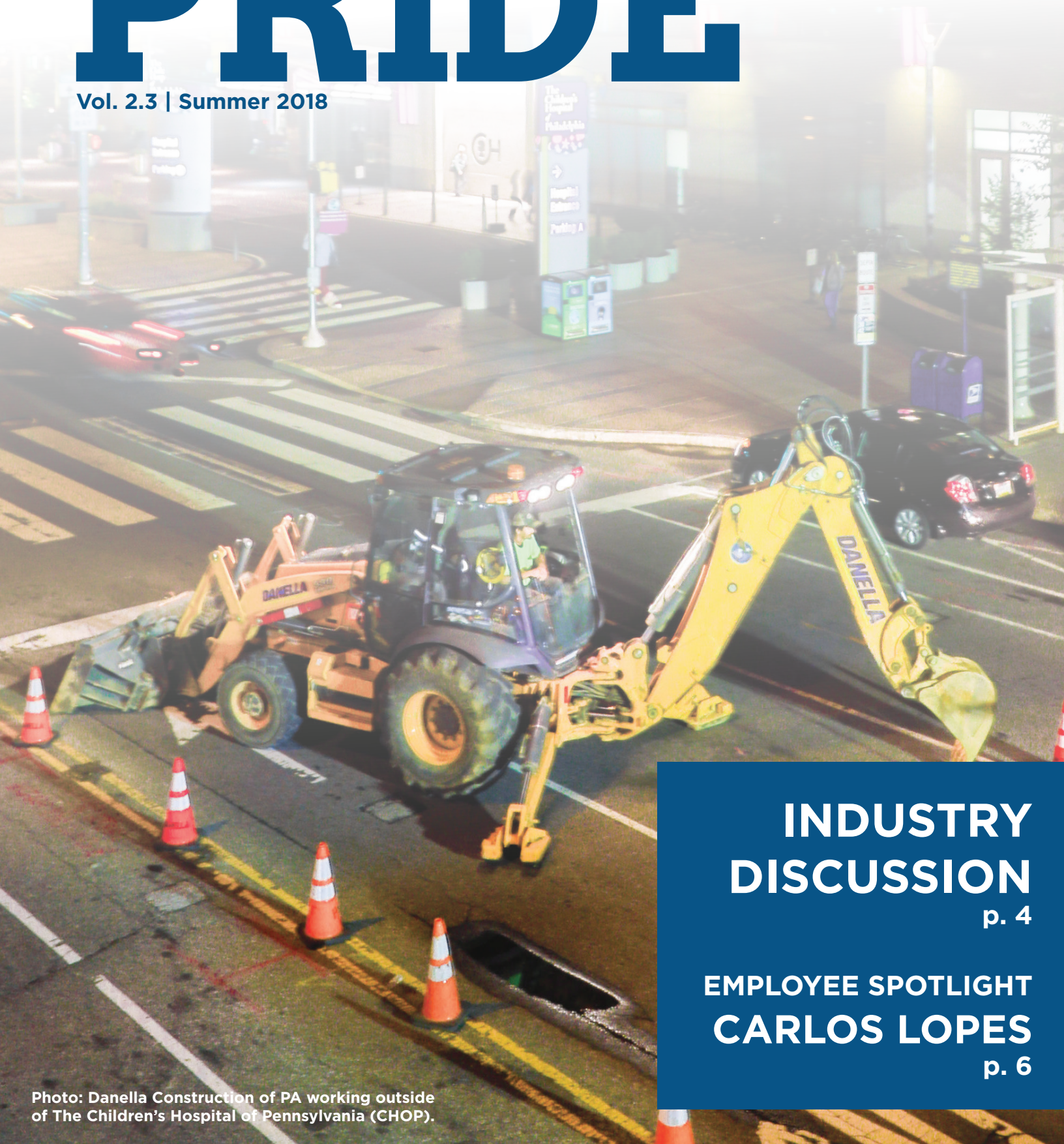
Photo: Danella Construction of PA working outside of The Children's Hospital of Pennsylvania (CHOP).