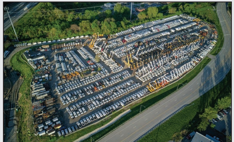
Above, The 2019 Danella Equipment Auction, which was the largest auction to date for equipment and vehicles offered.

Questions? Visit jjkane.com or call them at (610) 274-1968.