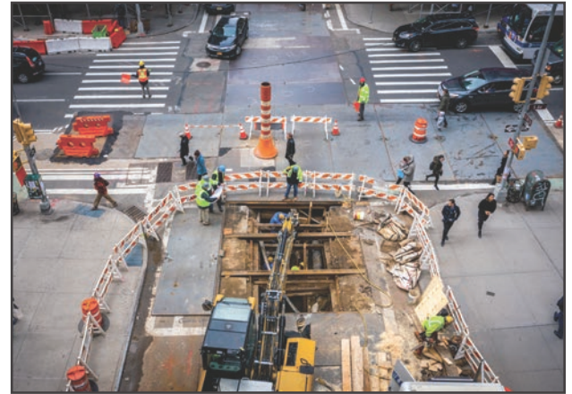
DCC-NY continues to perform in highly populated areas around NYC. Check out this aerial photo overlooking a steam replacement job on 20th Street.

To our teams new and old, let's continue the trend of growth and safety for 2020, so all can return home safely to their families each, and every day.