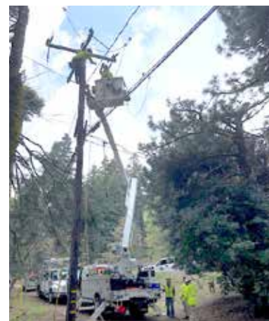
Above, Crews working in the Lake Arrowhead, CA area.

Danella Power Services of California has since begun work in the Lake Arrowhead, CA area performing energized distribution work for a large electric company. Over 100 I.B.E.W. Linemen, numerous CMCs (Construction Material Coordinators), and office staff are working tirelessly seven days a week to undertake a bottleneck of work that needs to be completed to ensure safe power distribution to millions of customers. More linemen, CMCs, and office staff are being added every day to the team to ensure the success of our new western location.